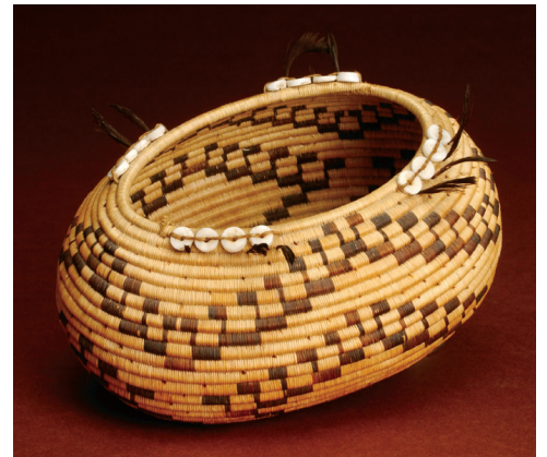
Three-Rod Coiled Boat Basket, Pomo; collections of the Grace Hudson Museum