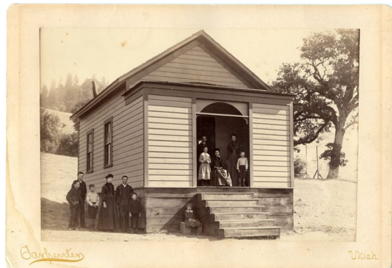
Above: Sherwood Grammar School photo, Right: Pomo cradle basket, likely from Lake County.