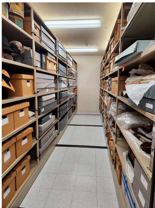
A peek inside our material culture collections vault

The size of our collection means that we have a lot of cards. This presents a challenge when one is trying to research a single object. Also, cards can only hold so much. Consequently, past Museum staff (for whom we are SO thankful!) found other ways to record information, including worksheets and inputting data into Excel-like computer documents. As technology changed, so did techniques for tracking objects. Over time, a number of different