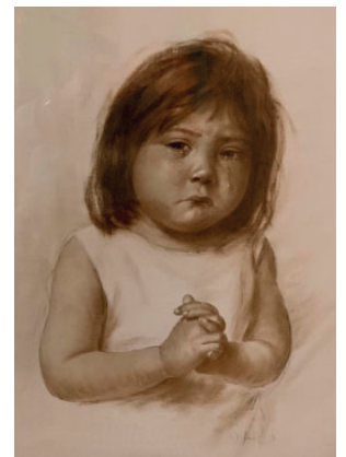
Bitumen sketch of Ta-le-a by Grace Hudson