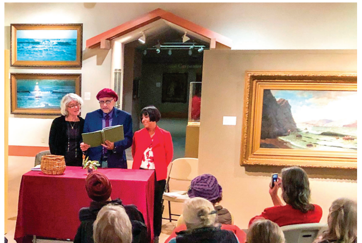
Poetry among the paintings.