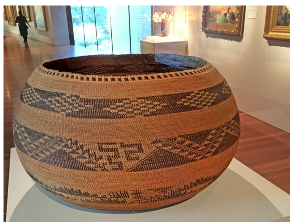
This large 1890s Pomo basket, on loan from the Grace Hudson Museum, marks the entrance to the Tavernier/Elem Pomo exhibition at the de Young Museum.

For those of you who saw the show via the bus trip—or made the trip on your own—you can attest to the equal weight given in the exhibition to Jules Tavernier’s artistic career in America and also to the artistry, culture, devastation, and renewal of Pomo peoples in the region encompassing Lake, Mendocino, and Sonoma Counties. The catalyst for creating the show was the acquisition of Tavernier’s prodigious 1878 oil painting, Dance in a Subterranean Roundhouse at Clear Lake, California , by The Metropolitan Museum of Art in 2016. One could easily imagine The Met curating an exhibition solely devoted to Tavernier’s work as a way of exploring the artist and what drew him to an exotic life in the American West. They pursued a more enlightened and richer path, however, collaborating with the de Young and multiple Pomo