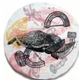
Diver IV , by Marilyn Propp

This exhibition showcases exquisitely handcrafted artworks all made from paper. While aesthetically intriguing and beautiful, they also attempt to explore important social issues of the day such as environmental crisis and social disparity around the globe.