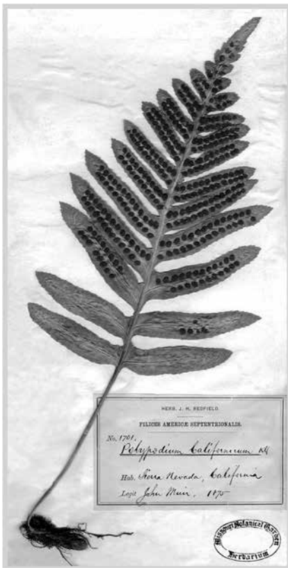
Left: Digitally restored image of a California Polypod fern ( Polypodium californicum ).