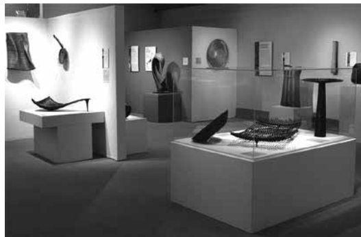
The Modern Twist exhibit at the Grace Hudson Museum