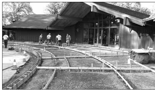
Concrete forms for new entrance, done by A-Z Paving