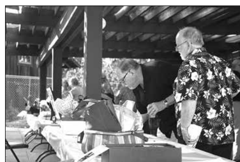
Perusing silent auction items from generous donors