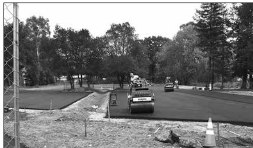
Paving around the new central bioswale in the updated lot